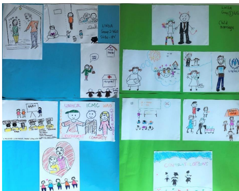
Storyboards addressing the impacts and recommendations to address Intimate Partner Violence and Child marriage

The Storyboard exercise was undertaken in small groups and involved each group identifying an issue of concern for refugee women and girls in KL and then preparing a series of pictures to describe the problem, impacts and potential solutions involving refugee women. Each group then presented their storyboards, analysis and recommendations.