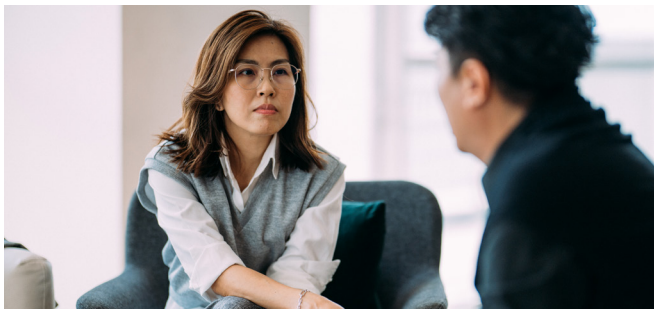
Black Dog Institute

Our ability to deliver world-class medical education and significant healthcare breakthroughs couldn't be achieved without the strength of our affiliated medical research institutes. Explore our UNSW Medicine & Health partnerships and how they contribute to improving health outcomes in Australia and beyond.