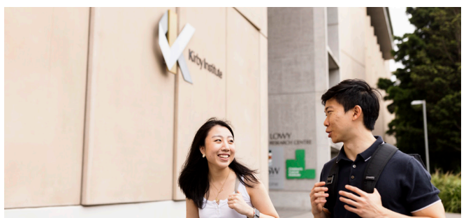
The Kirby Institute