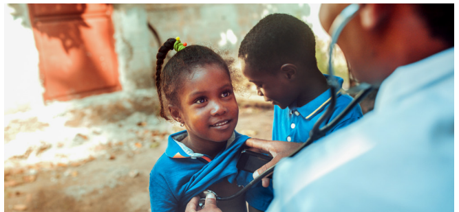
The George Institute