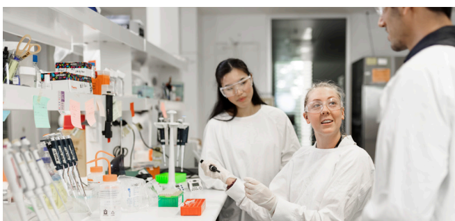
Garvan Institute of Medical Research