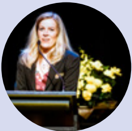
Leadership & Governance